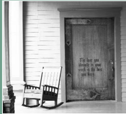
The Roycroft Inn

For additional Hotel information, please call 1-800-821-1881.