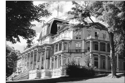
The Athenaeum Hotel

Celebrating Western New York's Historic Turn-of-the-Century Arts & Crafts Trail